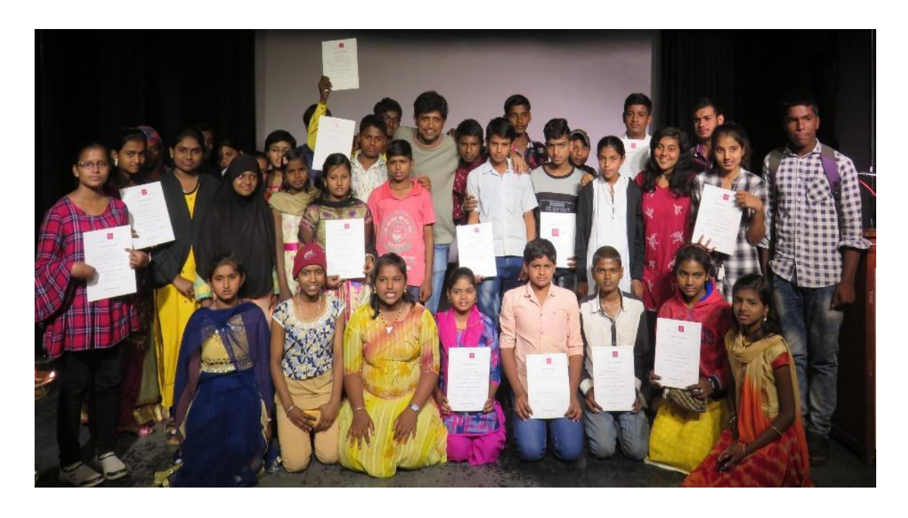
Scholarship Awardees - SSP3

55 scholarships were awarded in 2018 – 2019. Details of the SSP are available on our website.