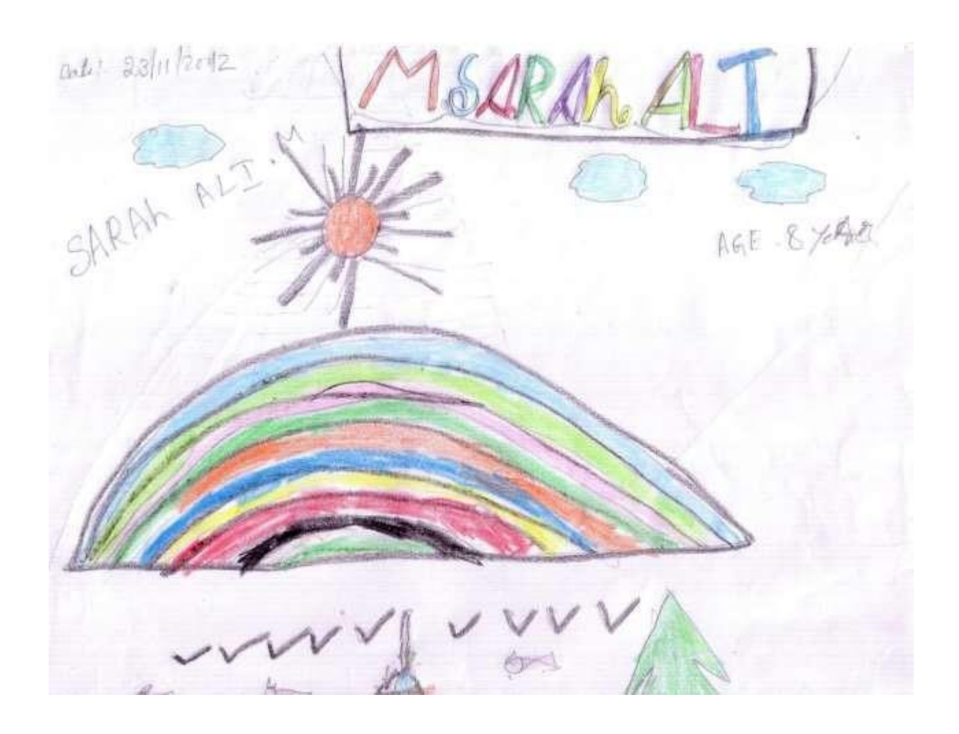
"There is always sunshine and rainbow in the lives of these children. We have to learn to see it!"

Samiksha Foundation - Caring for Children with Cancer - <a href="www.samikshafoundation.org">www.samikshafoundation.org</a> Facebook: <a href="https://facebook.com/samikshafoundation">https://facebook.com/samikshafoundation</a>