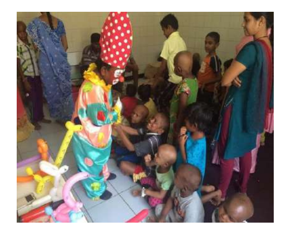
Birthday and gifts by our resource partners Jumpori.