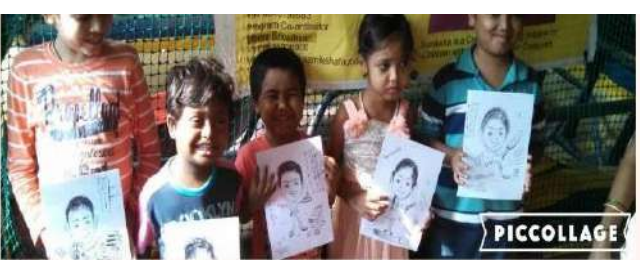
Caricature by Jumpori team