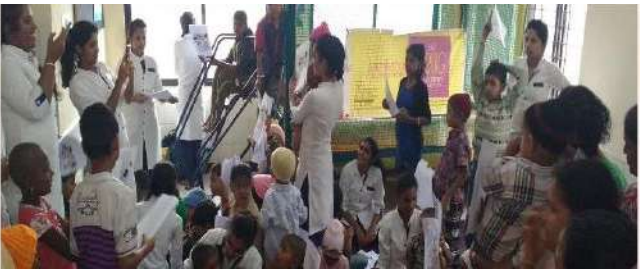
Activities by students from Maharani College